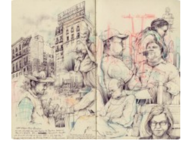
'The Quantified Self' – Charlotte Rose Emerson, FdA Illustration <http://blogs.arts.ac.uk/camberwell/2015/07/15/thequantified-self-charlotte-roseemerson-fda-illustration/>